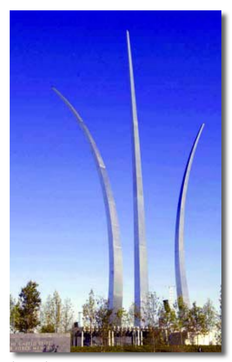
fighters flew over the crowd and memorial in chronological order, providing visual evidence of the evolution of military flight."

The magazine also noted, "The Air Force Band performed several pieces while a video was shown with clips from pilots climbing into World War II bombers to modern-day airmen working in the sands of Iraq. Several aircraft ranging from World War I bi-planes to today's stealth bombers and